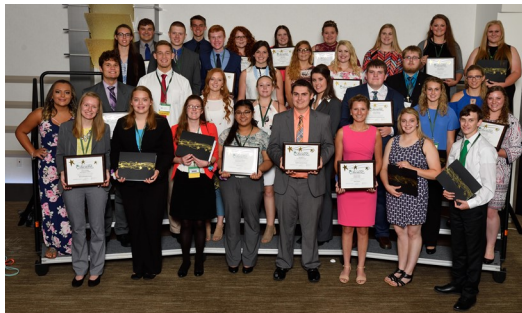
2018 State Award winners in the senior division with their plaques at 4-H Exploration Days.

Michigan 4-H true leaders ages 11 and older have an opportunity to be recognized for the great work they do in 4-H by completing a state award application. A Michigan 4-H State Award is the highest honor bestowed on a Michigan 4-H member and provides an opportunity to receive recognition for their engagement in rich learning experiences that result in outstanding knowledge and life-skill development.